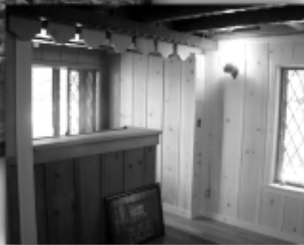
Restoring Whittell's wet bar in the Old Lodge began in 2004.

The Thunderbird Lodge, built by eccentric San Francisco millionaire George Whittell, Jr. between 1937 and 1940, stands today as a significant cultural landmark in the early development of Lake Tahoe.